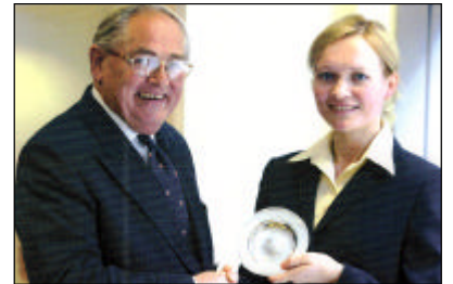
The K C Wu Memorial Lecture and The Lombard Prize Presentation