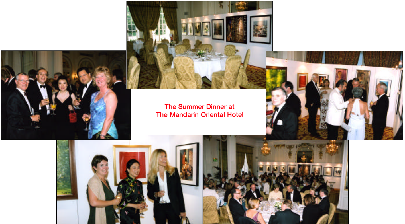
The Summer Dinner at The Mandarin Oriental Hotel

Rachel Lomax, was a popular guest speaker at a Guild Dinner at the London Stock Exchange on 22nd June. Only that day their new artwork entitled "Fireworks from Heaven" resembling multi-colored cascading snowflakes had been proudly unveiled. Two days later it was no longer there. Perhaps, given the Exchange's somewhat turbulent past they might have called it something else! (I am told there is now an empty space in the atrium - over to the members for creative thinking!) Rachel Lomax delivered a forthright and witty speech on the ups and downs in the relationship between the Treasury and the Bank of England. She felt today's key values were "openness and transparency and a willingness to face up to awkward facts". This was "light years away from the secrecy, mumbo jumbo and self delusion that shrouded so much policy making in the past"